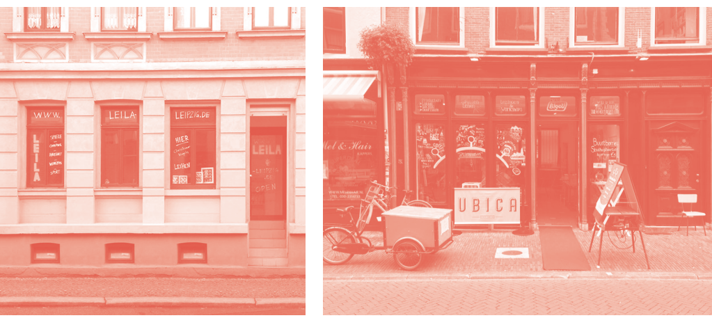
Frontside of the LoT ,Leila Leipzig', Germany.